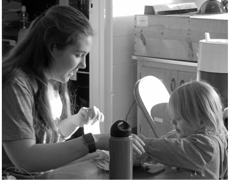
Recent participants of the Birch Bark Angel program held last December.