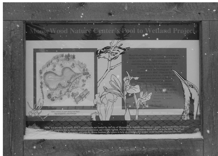
MooseWood's Pool to Pond Project sign is pictured above. The sign is located near the entrance to the nature center informing visitors what our plans are for its future.

The pond and wetlands, with access by boardwalk and pier, would become a natural educational center for area schools and Northern Michigan University students. Linear studies on water quality, habitat change, wildlife and invertebrate populations will be unique as nowhere else in the country has a cement pool been returned to a natural habitat. An overview of plans for renovation will be presented at the upcoming Annual Meeting to be held in early summer.