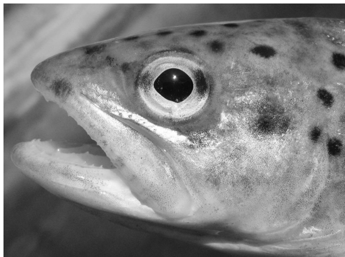
The Marquette State Fish Hatchery raises both lake and brook trout along with a hybrid of the two called a splake.