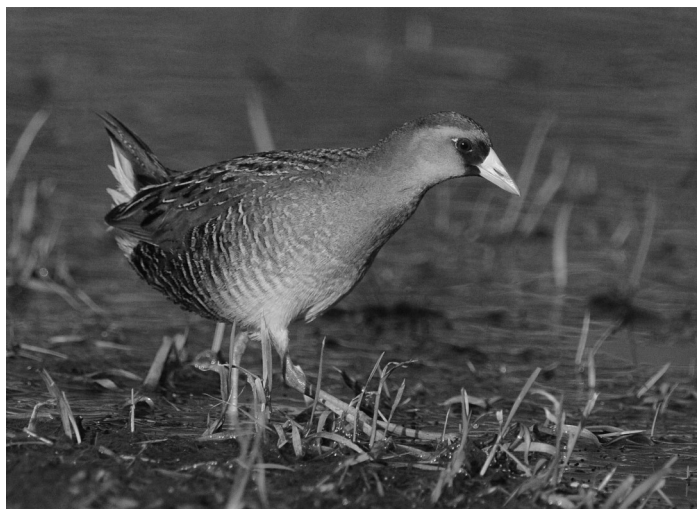
The Sora is a member of the rail family. Usually quite shy, it pokes around the vegetation along the edge of the water, and rarely comes out into the open.

This adventure is sponsored by Wells Fargo Advisors of Marquette, MI. To register for future birding adventures or for more information, please visit www.moosewood.org .