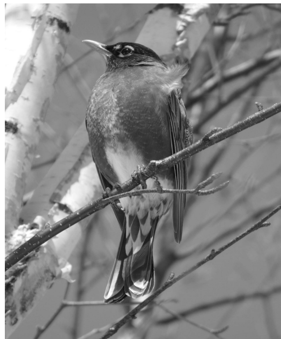
An American Robin sits in a white paper birch tree.