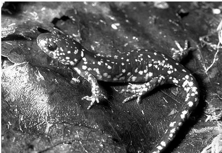
Blue-Spotted salamanders spend most of their time hiding under logs, rocks or leaf litter except when they come out to breed in early Spring. If you would like to take part in its care and feeding, consider adopting through the Adopt-a-Critter program.

MooseWood would like to thank the Marquette Senior High School Environmental Club for participating in the program. Their names will appear on the animal exhibits in which they have adopted.